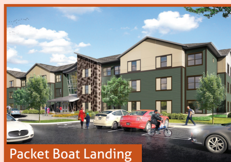
Packet Boat Landing

Both locations will also feature artwork that pays homage to the history of the region.