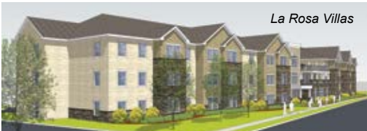
La Rosa Villas