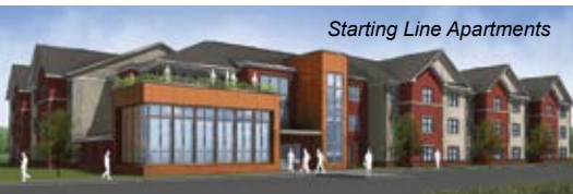
Starting Line Apartments

DePaul is increasing its ability to better serve even more people in need with updates to several senior living communities and the construction of several new affordable housing and supportive housing programs.