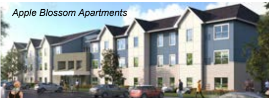
Apple Blossom Apartments