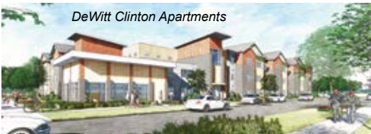
DeWitt Clinton Apartments