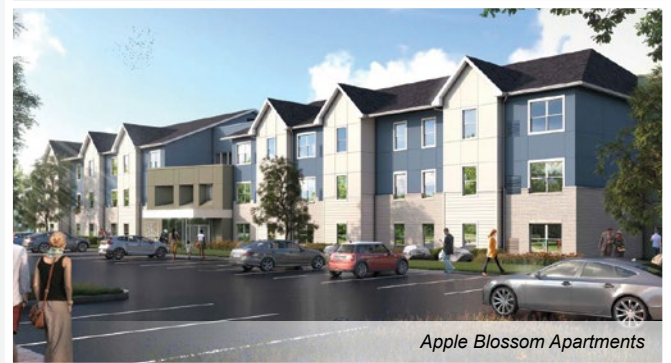
Apple Blossom Apartments