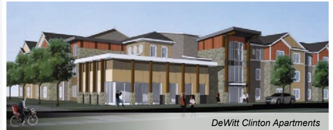
DeWitt Clinton Apartments