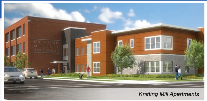
Knitting Mill Apartments

The Ridgeview Commons Apartment Treatment Program in Rochester, New York received a new fitness center, conference and storage room, an expanded community room, six new office cubicles and updates to the medication room.