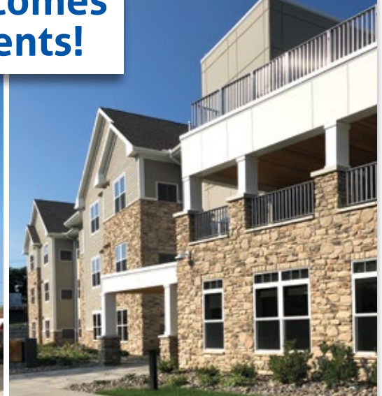
La Rosa Villas

T wo new DePaul affordable housing communities in New York are now open and accepting residents!