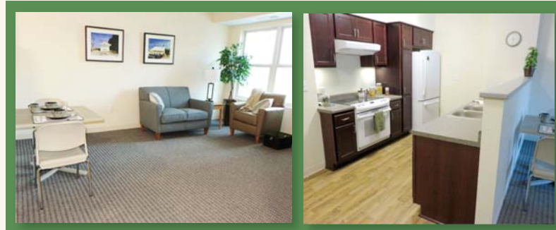
A glimpse inside DePaul's Trolley Station Apartments, a 48-unit community in Canandaigua, New York serving income-eligible tenants and offering on-site supports to accommodate tenants with behavioral health needs.

Agency, with an additional $3.25 million Medicaid Redesign Team subsidy, a $152,200 incentive from NYSERDA for compliance of standards with the Energy Star Certified Homes Program, and a $4.2 million equity investment from First Sterling.