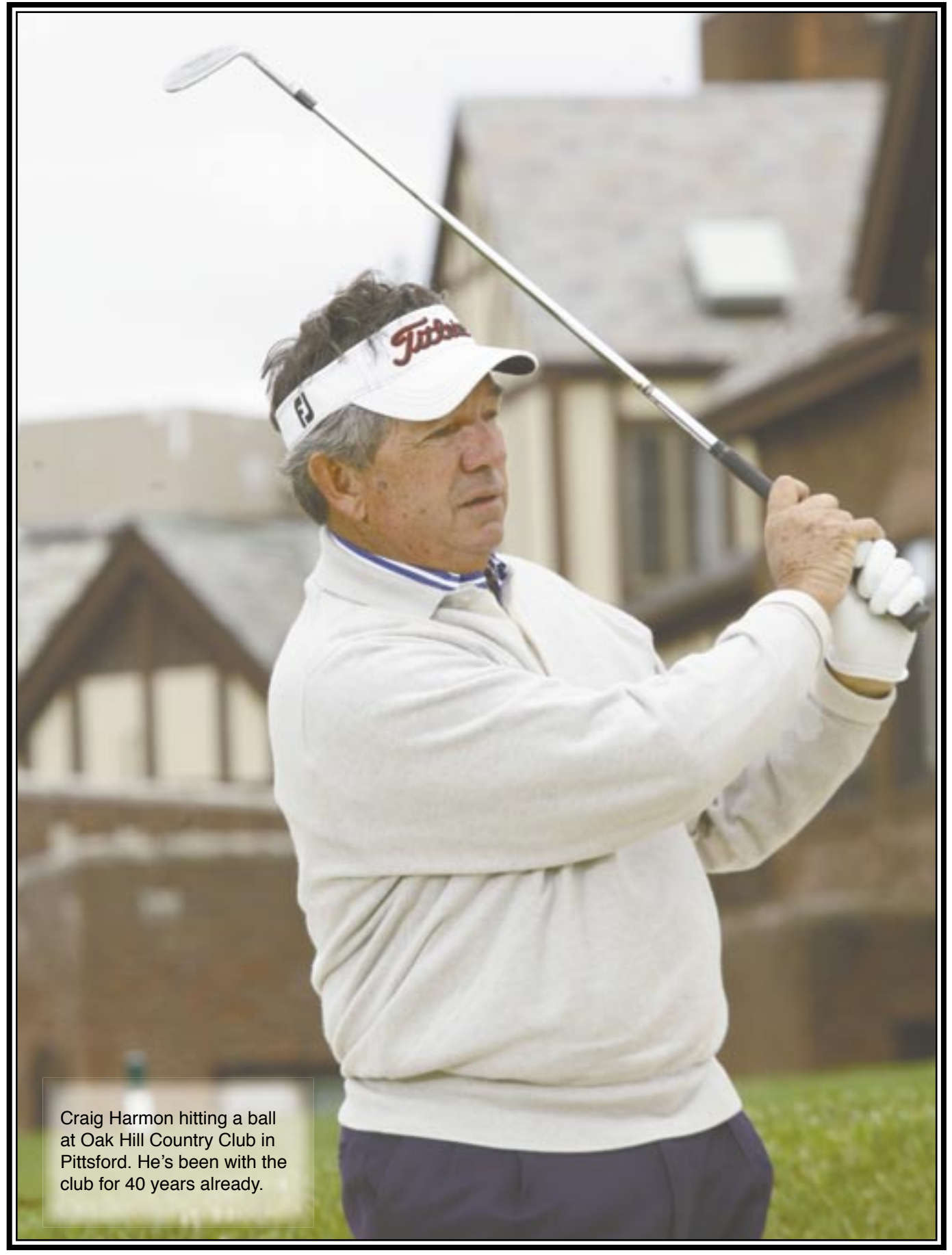
26 | 55 PLUS - July / August 2011