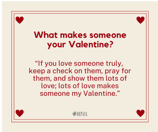
Seniors at Rolling Ridge in Newton Grove, North Carolina expressed their sentiments about all things love for Valentine’s Day.