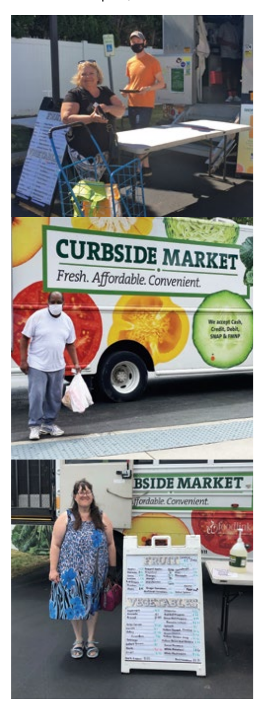
Pictured above, residents at DePaul's Ridgeview Commons and the Carriage Factory Apartments in Rochester, New York and the Trolley Station Apartments in Canandaigua, New York stock up on fruits and veggies at the Curbside Market.

ummer was filled with fresh produce delivered directly to the door of several of DePaul's Affordable Housing and Mental Health Residential communities thanks to Foodlink's Curbside Market. With over 30 distribution sites this summer, Foodlink's Curbside Market sells more than $300,000 worth of fresh produce annually. In addition to WIC, Foodlink accepts cash, debit and SNAP, and matches SNAP benefits up to $20 for customers.